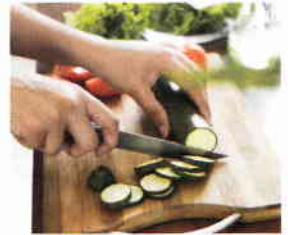
Chop on Sundays to set yourself up for the whole week.